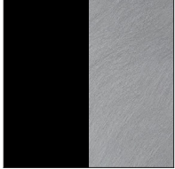
Black/Satin Aluminum - BSA

Digital: Not all screens are calibrated the same, and therefore, colors will appear differently between screens.