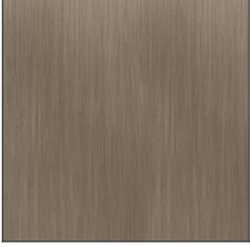
Brushed Bronze - BBZ