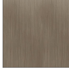
Brushed Bronze - BBZ