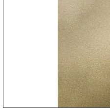
White/Gold Silver - WGS