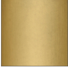
Brass - BRA