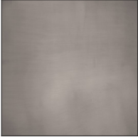
Pewter - PWT