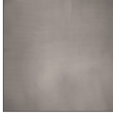
Pewter - PWT