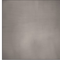
Pewter - PWT