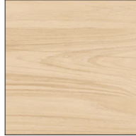
Natural Oak - OAK