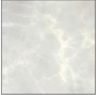
White Alabaster - WHA