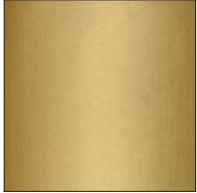
Bronze - BRZ