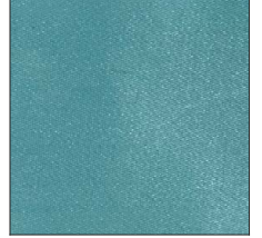
Turquoise - TUR