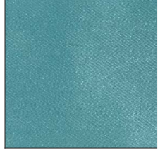
Turquoise - TUR