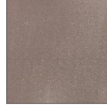
Turquoise - TUR