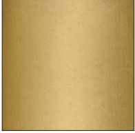
Bronze - BRZ