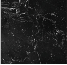
Black Marble - BLM