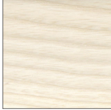
Ash White Oil Waxed - ASH