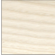
Ash White Oil Waxed - ASH