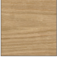
Oak Natural - OAK