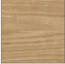
Oak Natural - OAK