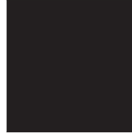
Black - BLK