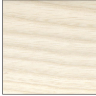
Ash White Oil Waxed - ASH