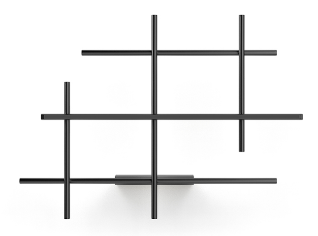
Backplate not required with a remote driver