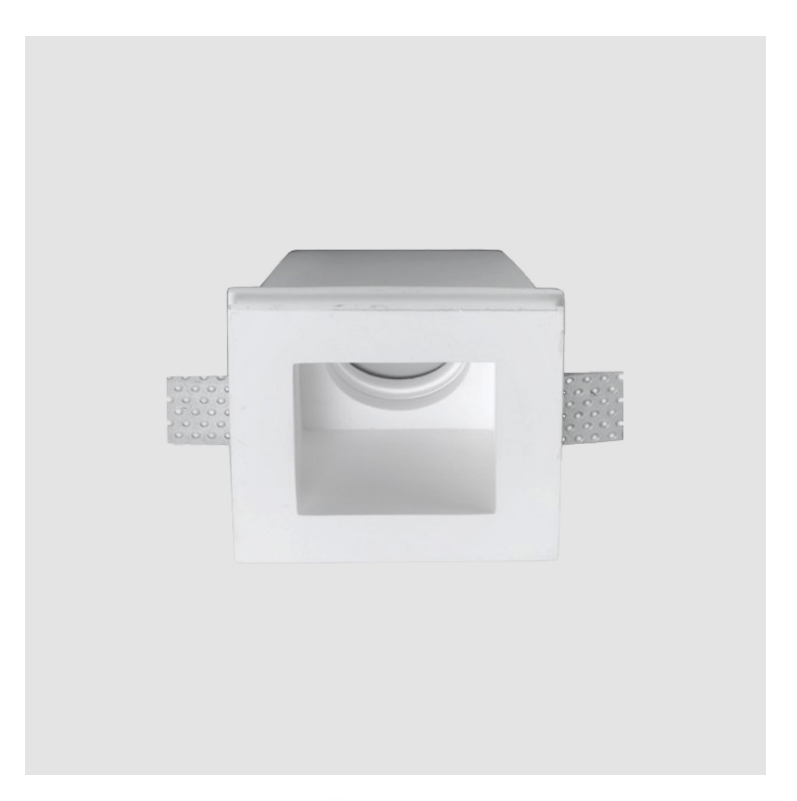
40mm 2 3/8"