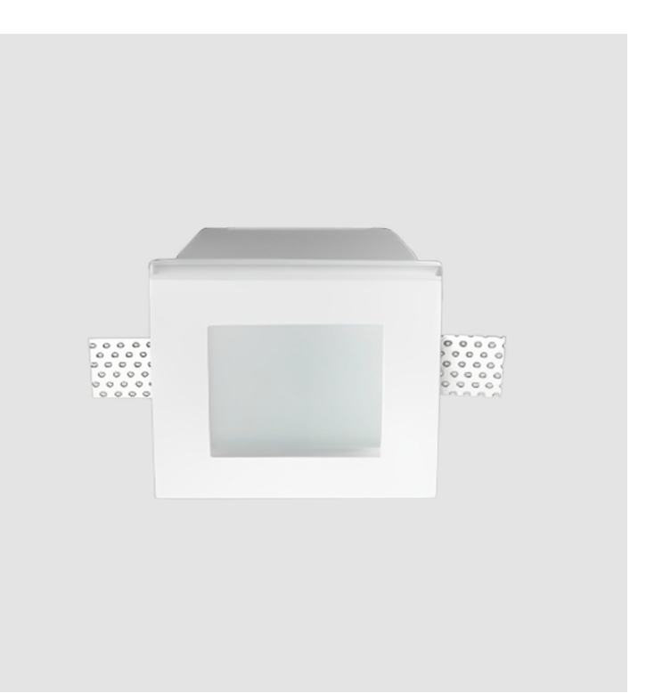
40mm 1 %16"