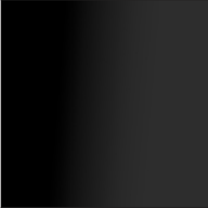
Black - BLK

Digital: Not all screens are calibrated the same, and therefore, colors will appear differently between screens. Physical: When texture is involved, there will be variations in color, character and tone within a product series and between product families.