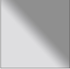
Polished Stainless Steel - PSS

Digital: Not all screens are calibrated the same, and therefore, colors will appear differently between screens.