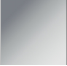
Stainless Steel - SST