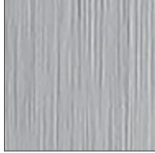
Natural anodized - ANA