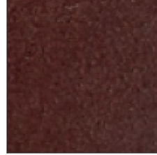
Corten - COR