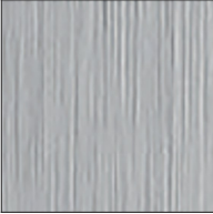
Natural anodized - ANA