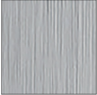
Natural anodized - ANA

Digital: Not all screens are calibrated the same, and therefore, colors will appear differently between screens.