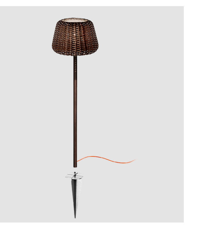
Ø350mm 13 3/4"