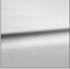
Stainless Steel Inox - SST

Digital: Not all screens are calibrated the same, and therefore, colors will appear differently between screens.