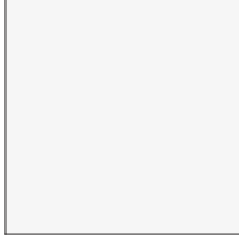
White - WHI