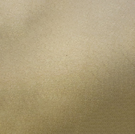
Gold Silver - GSR