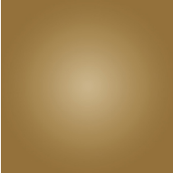
Bronze - BRZ