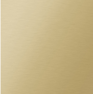
Matte Brass - MBR