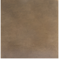
Aged Solid Brass - ASB