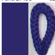
LAPIZLAZULI Pant. 2745C 62