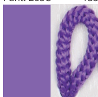
AMORATADO Pant. 265C 135