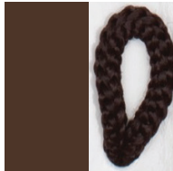
MARRON Pant. 476C 187