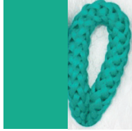
JADE Pant. 3268C 311