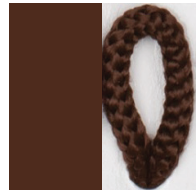
TABACO Pant. 1545C 203