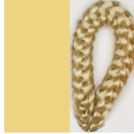
GOLDEN Pant. 7403C 7