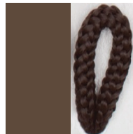
MADERA Pant. 7519C 2183