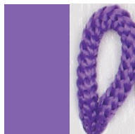
AMORATADO Pant. 265C 135