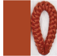
ARCILLA Pant. 1675C 150