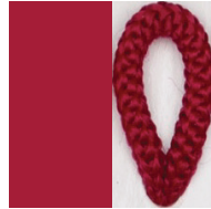
SATAN Pant. 207C 19