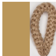
ARENA Pant. 465C 151