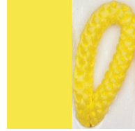
CANARIO Pant. 106C 9