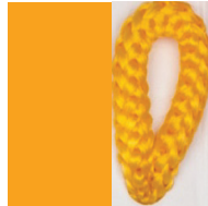
NECTAR Pant. 137C 1871