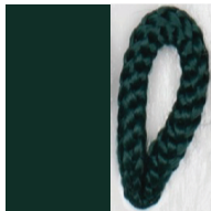
MUSGO Pant. 5535C 320