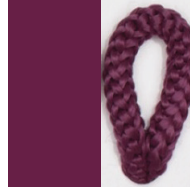
RUBINA Pant. 229C 285