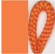
NARANJA Pant. 164C 87