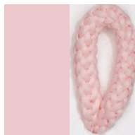
ALEJANDRIA Pant. 196C 261