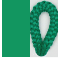
VERDE BILLAR Pant. 340C 353