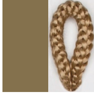
ORO Pant. 872C 16