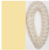
CRUDO Pant. 7401C 170