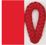
FUEGO Pant. 185C 245