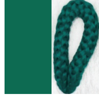
VERDE OSC. Pant. 3298C 358