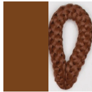
CAMELLO Pant. 731C 161