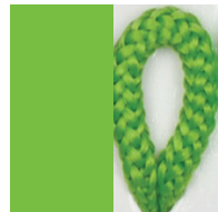
CIRUELA Pant. 368C 104