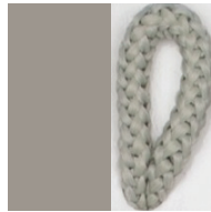
OPALE Pant. 402 1442