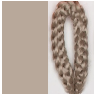
ASTRACAN Pant. 7529C 101