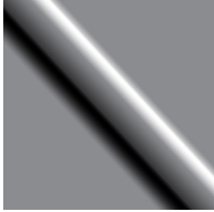
Chrome - CHR