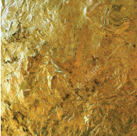
Gold Leaf - GLF