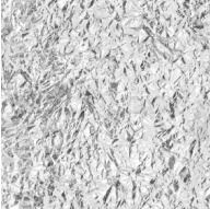
Silver Leaf - SLF