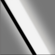
Chrome - CHR

Digital: Not all screens are calibrated the same, and therefore, colors will appear differently between screens.