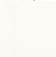
Matte White Lacquer - MWL