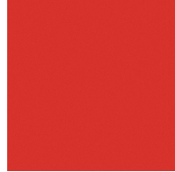
Kissing Aphrodite - 19 (KIA)