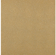
Olive Breeze - 30 (OBR)