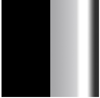
Black/Polished Aluminum - BPA

Digital: Not all screens are calibrated the same, and therefore, colors will appear differently between screens. Physical: When texture is involved, there will be variations in color, character and tone within a product series and between product families.