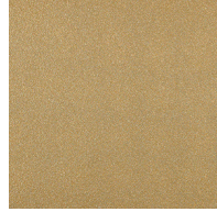
Jazz Gold - 29 (JAG)