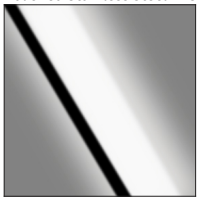
Polished Stainless Steel - PSS

Digital: Not all screens are calibrated the same, and therefore, colors will appear differently between screens.