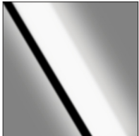
Polished Stainless Steel - PSS

Digital: Not all screens are calibrated the same, and therefore, colors will appear differently between screens.