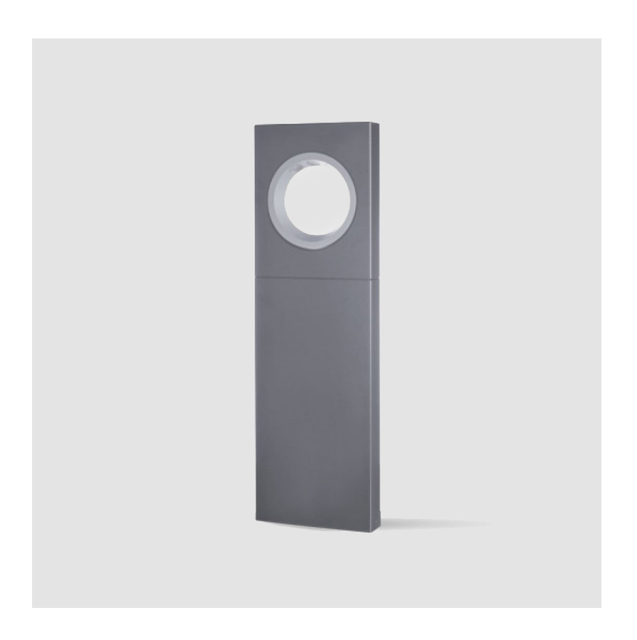
250mm 9 13/16" 57mm 2 1/4"